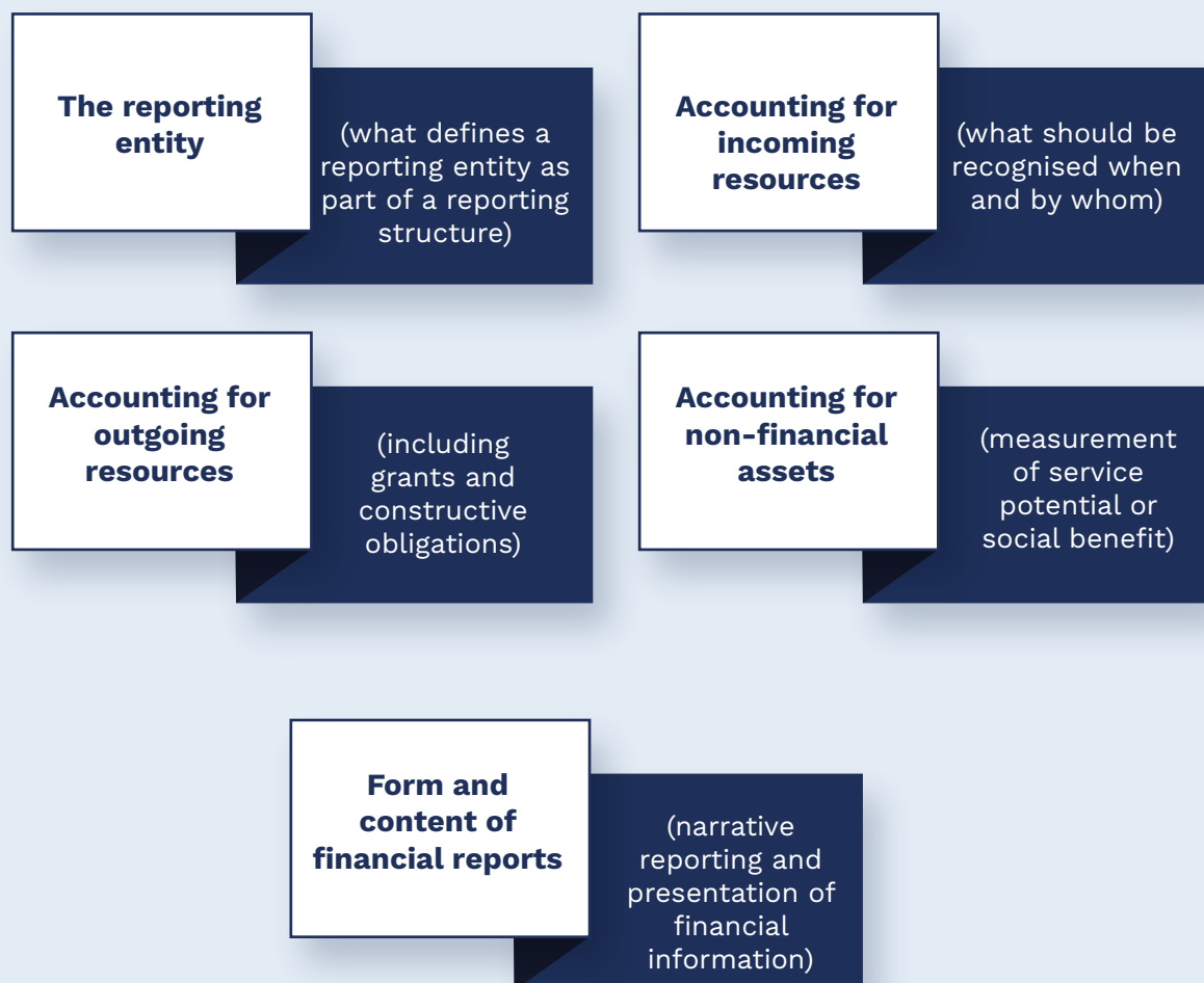
Figure 2.1: NPO financial reporting issue categories 20